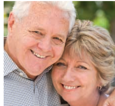
What will your legacy be? Here's how you can start building it today with Project HOPE.

You can help shape Project HOPE's future through a unique gift opportunity known as a charitable gift annuity. You make a donation and we, in turn, pay you a fixed, dependable payment for the rest of your life. After your lifetime, the remaining balance allows Project HOPE to continue saving lives around the world. Another way to maximize your support is to include Project HOPE in your estate plans. When you include Project HOPE in your will, it doesn't affect your current cash flow or assets, and it's simple to revise if your circumstances change. Best of all, you have the satisfaction of knowing that your legacy will be one of hope for others.