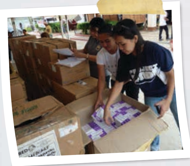
Your support sent emergency supplies to the Philippines after the typhoon in 2013 and the one last December. Thanks to you, victims of these disasters got the help they needed.

Your generous support has enabled Project HOPE to be one of the organizations responding to this vast need. So far, you have helped to send $107 million in medicine and medical supplies to 147 refugee camps. To this point, some 217,000 refugees have gotten help, but there is much more to do in this growing crisis.