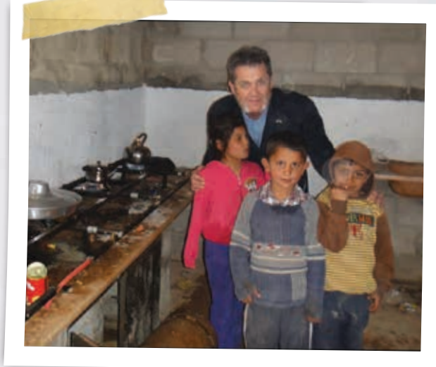
Syrian refugees face tough odds for survival, but your generous support is sending medicine and supplies that will save lives in this humanitarian crisis.

This was the second major typhoon to hit the Philippines in just over a year. In November 2013, when Typhoon Haiyan struck, you helped then, too. Since that time, you've enabled us to send a total of $24 million in medicine and supplies, and you helped more than 270,000 victims get treatment and care.