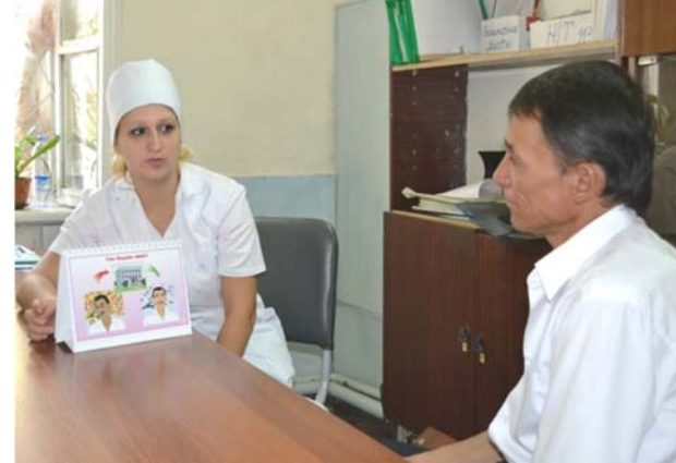
Trained TB nurse is counseling patient