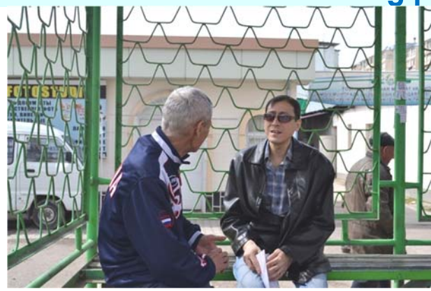
TB mini session with drug user, bus stop, Tashkent