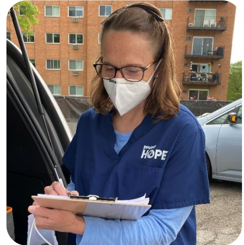
Project HOPE team member supporting long-term care facilities in the City of Chicago and Cook County to reduce COVID-19 infection risks.

The geographic distribution of COVID-19 continues to shift. Europe is reporting less than 15% of the daily global incidence. Over the