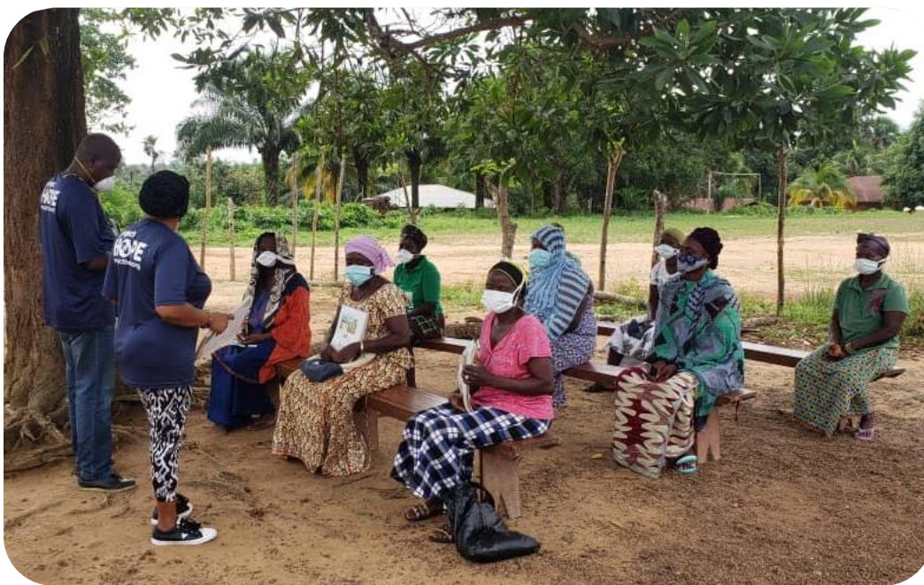
Project HOPE trained 22 Mother Care Groups through its Saving the Newborn Initiative to conduct community-based COVID-19 education. To-date, more than 16,700 people have been reached with COVID-19 risk and prevention information.

The COVID-19 training materials continue to be available on Project HOPE's website via download for health care workers, public health professionals, health care leadership, and key frontline personnel. Applications to gain access to the training materials can be submitted through Project HOPE's website: https://www.projecthope.org/covid-19-training-for-health-care-workers-preparedness-and-response/ . Participants who have completed the downloaded training have demonstrated a 21% improvement in knowledge between the pre and posttest.