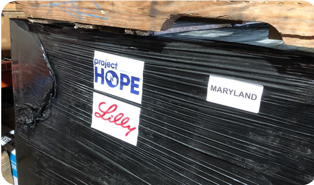
Project HOPE is formally handing over 21,000 KN95 masks donated by Eli Lilly and Company to officials of Prince George's County, in support frontline health workers in Maryland on June 11.

Project HOPE is currently supporting 22 LTCFs with 3,379 residents and more than 1,095 reported COVID-19 cases. This further highlights the severe impact of COVID-19 on residents in LTCFs and the continued need to support these facilities in infection prevention and control efforts and risk mitigation.