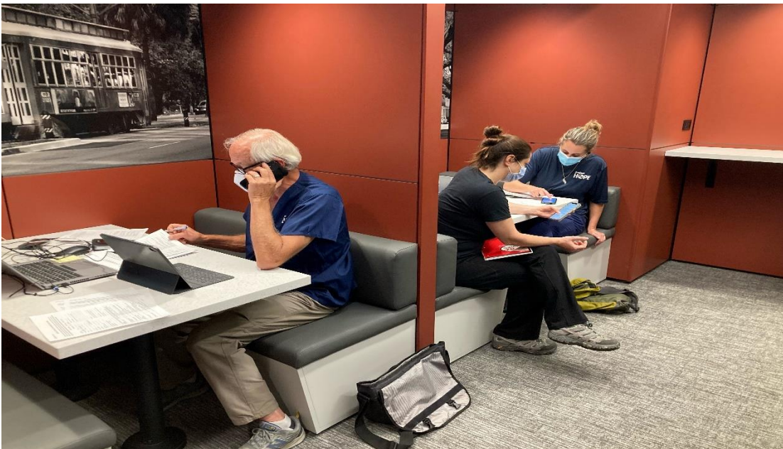
Figure 2. Project HOPE's Emergency Response Team (ERT) conducting phone triage at the Regional Special Needs Shelter in New Orleans.

Project HOPE's ERT of medical practitioners continues to provide medical services, emergency prescriptions, inducing first aid, home and community-based wellness checks and basic care, triage, and health screenings to the affected population. The ERT is providing such services at evacuation sites, regional special needs shelter, and apartment complexes within New Orleans, Marrero, and Belle