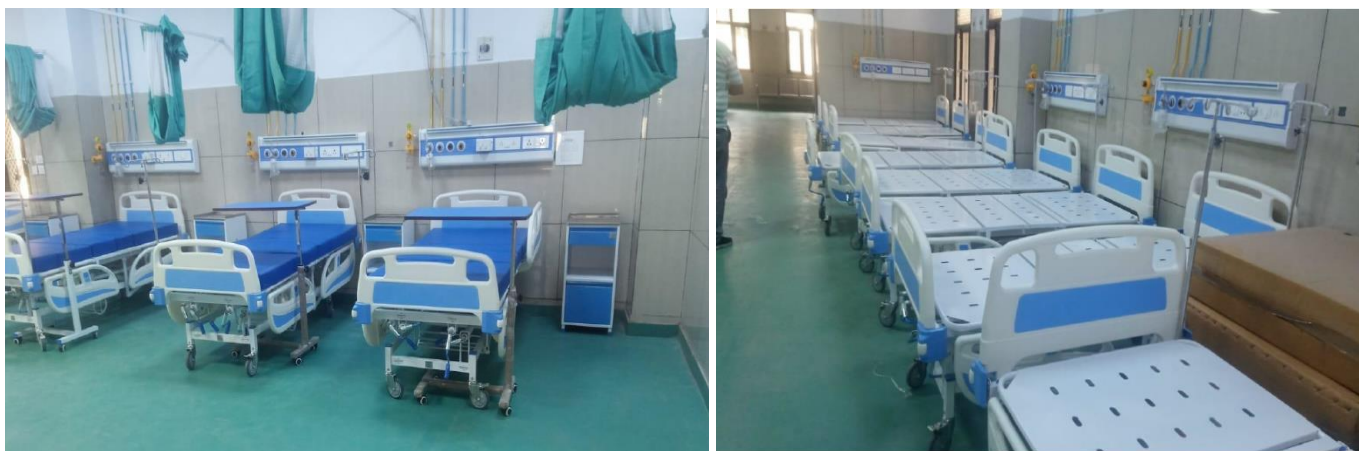
Figure 1. Hospital beds being set up in the ICU units.

In Odisha, the COVID-19 Canter Campaign reached 139 villages in 4 districts. A total of 853 Accredited Social Health Activists (ASHAs) were also trained across the 4 districts. In Delhi, the Canter COVID-19 campaign reached 2,938 children, 1,198 men, and 3,478 women.