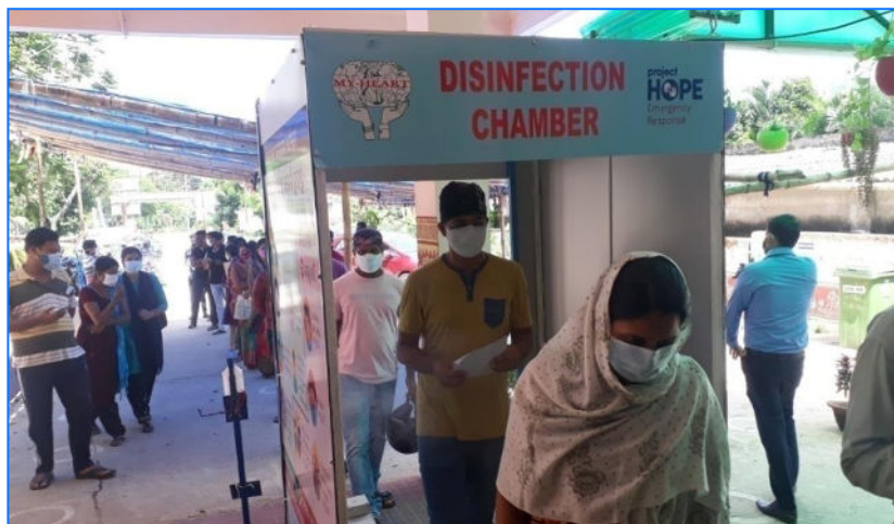
Figure 3. One of the Disinfection Chambers purchased with the support of Project HOPE.

March of Youth for Health, Education and Rural Trust (MY-HEART) has distributed medical equipment across several Odisha districts; equipment such as ventilators, oximeters, disinfection chambers, and oxygen patients with their pulse oximeters; 2,200 visitors per day at 6 health institutions are disinfected in the disinfection chambers thereby reducing concentrations. Because of this lifesaving medical equipment: the District Headquarter hospital of Malkangiri has a ventilator to treat critical COVID-19 patients; ASHA workers can now measure the oxygen level of their the spread of the COVID-19 virus. The 1,044 trained ASHAs are providing COVID-19 services to a population of 10,44,000. The supply of equipment at health institutions greatly increased the availability of PPE for use by medical providers and those directly involved with COVID-19 testing and treatment.