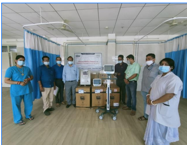
Figure 2. Handing over of equipment at District Head quarter hospital of Malkangiri District.

In Odisha, the COVID-19 Canter Campaign reached 139 villages in 4 districts. A total of 853 Accredited Social Health Activists (ASHAs) were also trained across the 4 districts. In Delhi, the Canter COVID-19 campaign reached 2,938 children, 1,198 men, and 3,478 women.