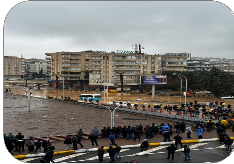
Şanlıurfa's city center endured heavy flooding on Wednesday, trapping cars and compromising water supply, electricity, transport, and telecoms. At least five people have died and several are still missing. Şanlıurfa is only one of the multiple cities impacted by the significant rainfall. Photo by Project HOPE staff, March 15, 2023

Meanwhile, major seismic events continue to pummel southern Türkiye and northern Syria, including two 4.7- and 4.5- magnitude earthquakes in Malataya, Türkiye, and a 4.4-magnitude earthquake in Hatay, Türkiye this week. [1]