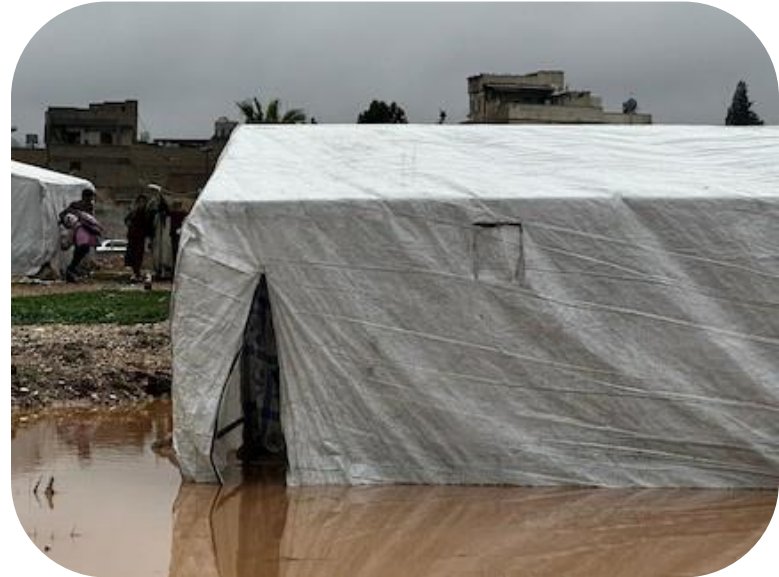
Formal and informal camps and settlements have been impacted by the heavy rain. A Roma settlement in Şanlıurfa, established prior to the earthquakes, is shown here underwater after this week's rain. Photo by Project HOPE staff, March 15, 2023

Humanitarian interventions in Syria have been strained by several access limitations, including those related to the ongoing civil conflict. This week alone, relief efforts to Aleppo City, among the cities most devastated by the earthquake, were suspended when the airport was forced to shut down due to nearby air strikes. Almost 80,000 families (roughly 360,000 people) have been displaced by the earthquakes and have relocated across 10 provinces. [iv]