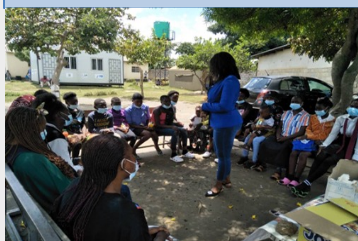
CATS session in Chilanga district

During qualitative assessment across all sites, HCWs and CATS testified towards the positive impact of the CATS on adolescent leadership, health and wellbeing