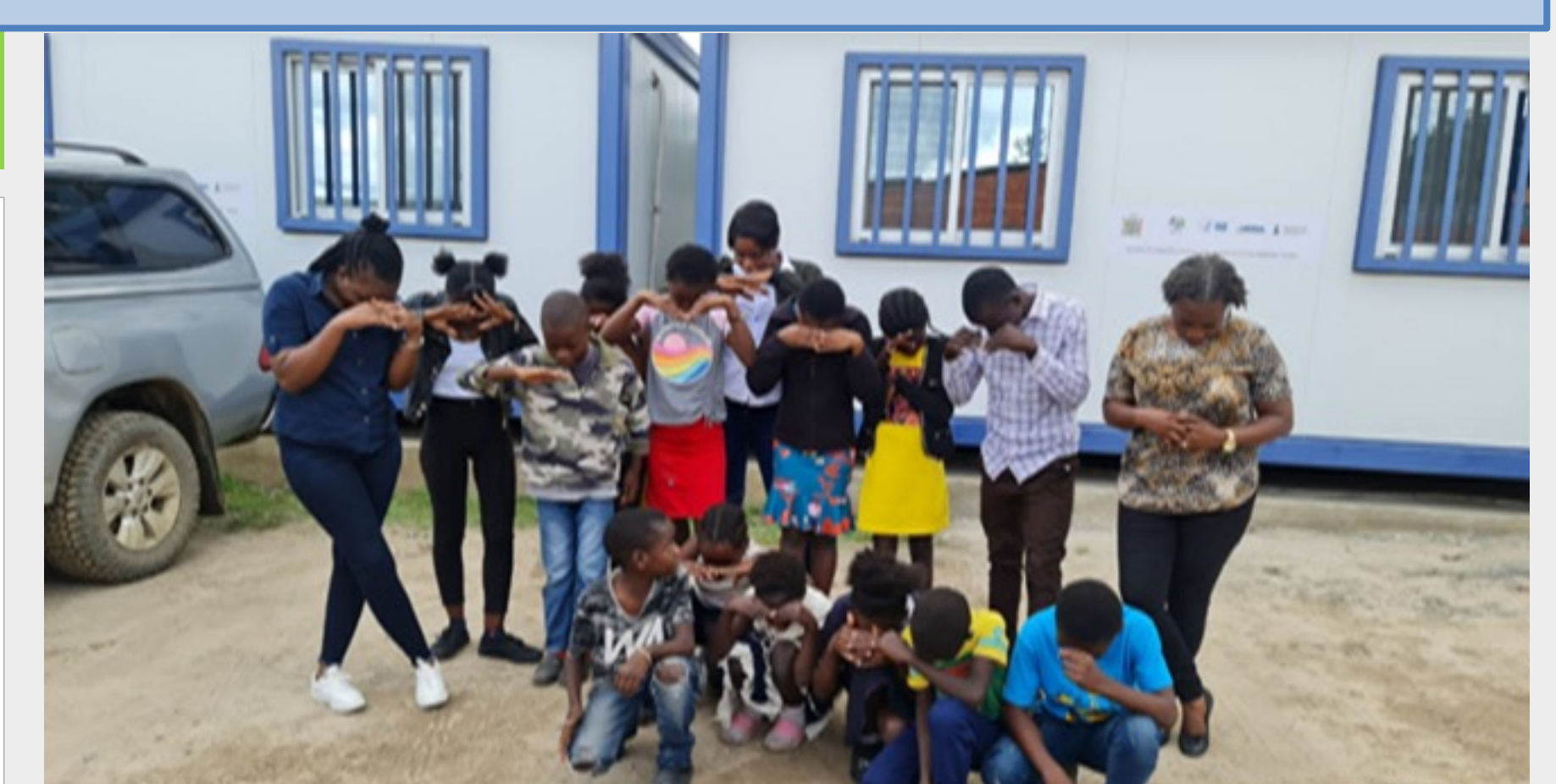
Adolescents participating in the midline assessment