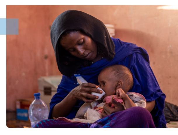
Project HOPE's work in Ethiopia is helping address the urgent health impacts of conflict and drought, which have affected millions of people

2022 marked a somber milestone as the number of people forcibly displaced crossed 100 million worldwide. As conflict endured in Ukraine, Project HOPE's emergency response evolved into long-term humanitarian programming to meet ongoing needs. Project HOPE also provided emergency nutrition, medicines, vaccines, and mobile medical units that reached tens of thousands of people in Ethiopia. In Colombia, where years of migration have pushed hospitals near the Venezuela border to their limits, Project HOPE provided badly needed medical equipment, health care workers, and maternal care to support women and girls in need.